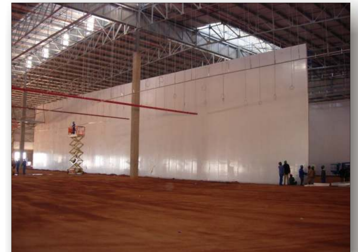
Woolworths Freezer Distribution Centre under construction