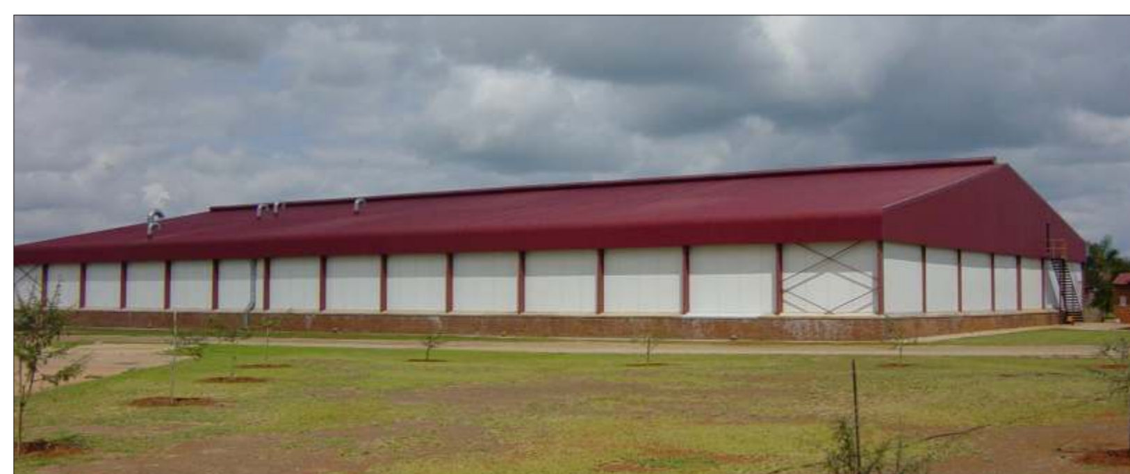
Modern Insulated Chicken Hatchery