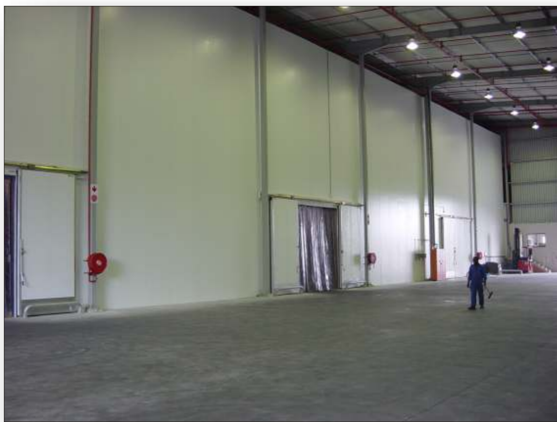
Cold Room Warehouse featuring insulated bi parting doors