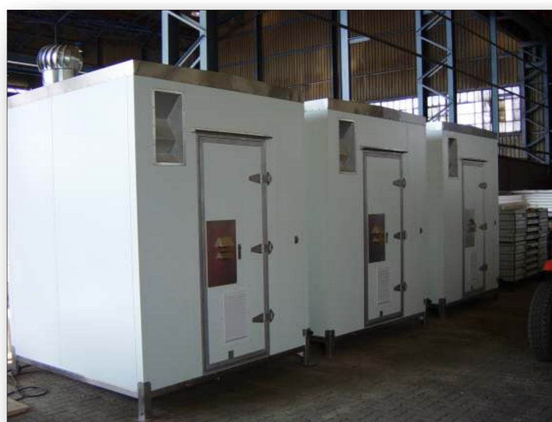
Insulated Telecoms Housing