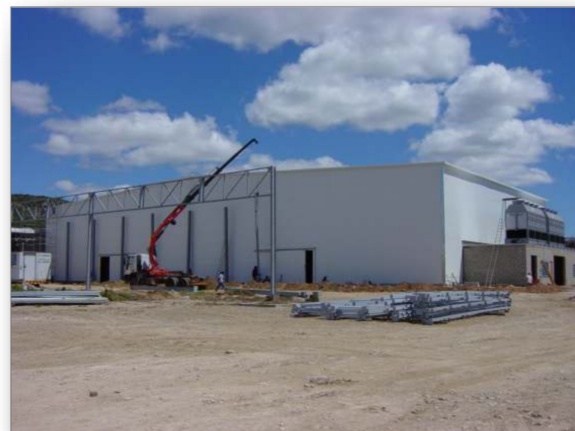
Apple Storage facility for Unifrutti